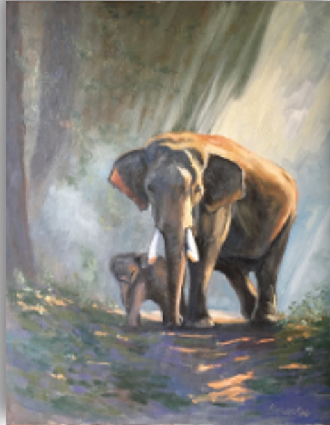
Fine Art- 2nd - Sonsoles Shack