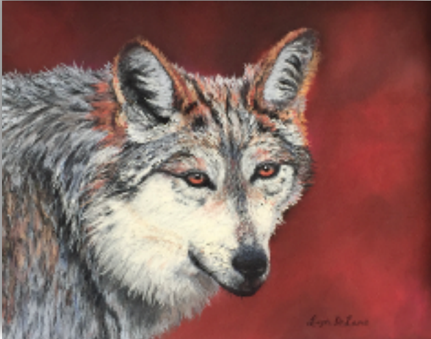
Fine Art - 1st - Lyn DeLano