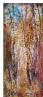
Lambrecht-Hould & Oliver