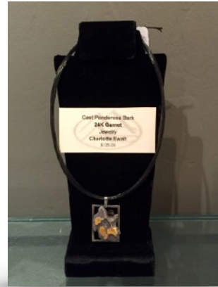
Charlotte Ewalt - Ponderosa Bark