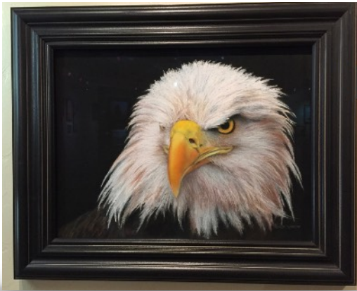
Ruth Dyer-Jablow - Eagle

Main Gallery Show - Wild By Nature - August 28 - October 27